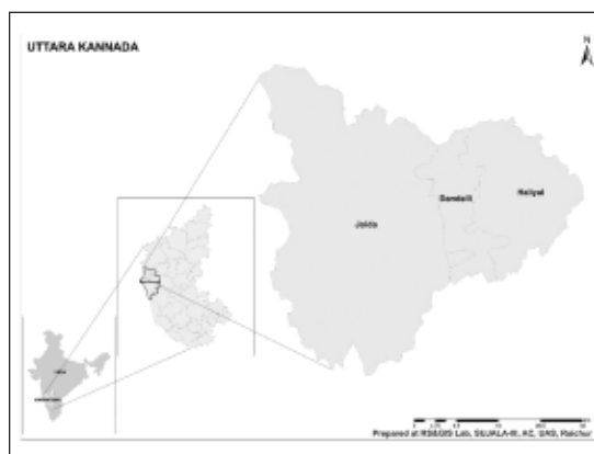
Fig. 1. Study area

From eleven villages of these taluks, 50 silkworm rearing farmers were selected randomly and a pre-tested and standardized interview schedule was used to collect the information from the respondents through personal interview. The data collected from respondents was tabulated and analyzed by using appropriate statistical tools such as frequency, percentage, mean score and rank. Statistical packages viz. , Microsoft excel was used for analysis.