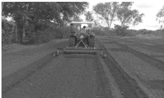
Fig. 3. Developed tractor operated ridger for basin lister.

The speed level of 2 \text{ km h}^{-1} gives the width of 0.668 m which is closer to the assumed value. The width of the furrow increases as the forward speed increases; this may be due to the increase in tripping action by the ridger blade to outward soil throw to form the ridge. The level of 0.50 m height from ground level gives the width of 0.653 m which is closer to the assumed value. The width of the furrow increases as the setting of ridger height increases; this may be due to the increase in soil penetration and throw by the ridger blade during working action to form the ridge. The attachment of full sweep one side gives the width of 0.659 m which is closer to the assumed value. From the study it is conclude that, the width of the furrow increases as the working cross-sectional area of ridger attachment increases. The basin lister functions smoothly and performs well in soil clod size less than 4.39 mm. The observed draft of 299.4 kgf at half sweep both side ridger at 0.525 m ridger height and a forward speed of 2 \text{ km h}^{-1} is closer to the intended draft of 275 to 300 kgf. The draft increases with increase in speed of tractor, with increase in depth of operation of ridging unit and with increase in working cross sectional area. The theoretical field capacity and field efficiency were 0.85 \text{ ha h}^{-1} and 80.28% respectively. The fuel consumption of tractor was 6.786 \text{ l ha}^{-1} and 3.078 \text{ l h}^{-1} . The operating